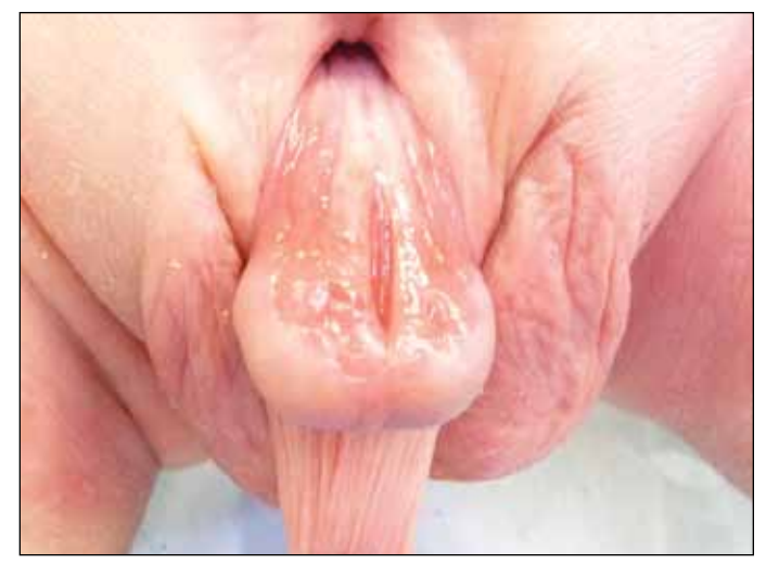
Fig 5. Epispadias.

Dorsal penile (DPNB) and ring blocks are effective techniques to manage circumcision-related pain. Based on a RCT that compared these two methods with EMLA for neonatal circumcision, there was no statistical difference in crying time and heart rate between a ring and DPNB, while EMLA was less effective.<sup>186</sup> Two other trials comparing EMLA to DPNB also demonstrated significantly lower behavioural