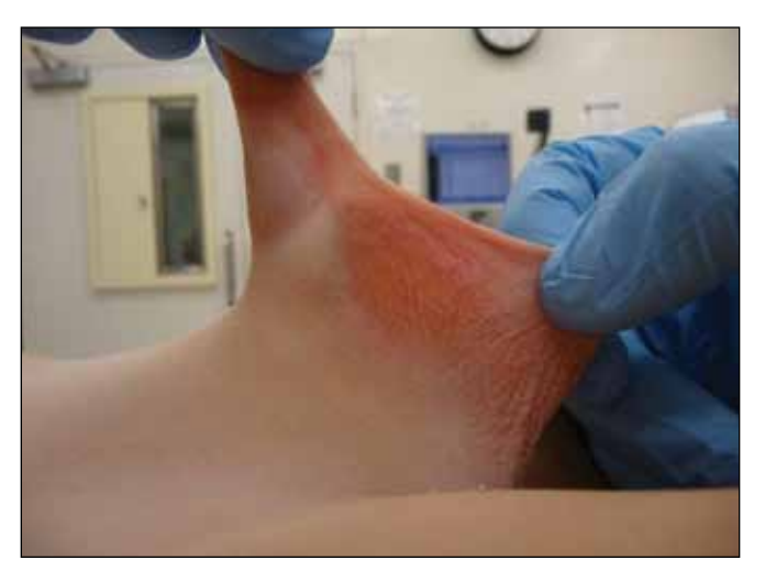
Fig 6. Peno-scrotal webbing.

The DPNB is performed by injecting subcutaneously at the 11 and 1 o'clock positions on the dorsum of the penis close to the base of the penis using a 25-gauge needle. It is important to aspirate prior to injection to prevent intracor-