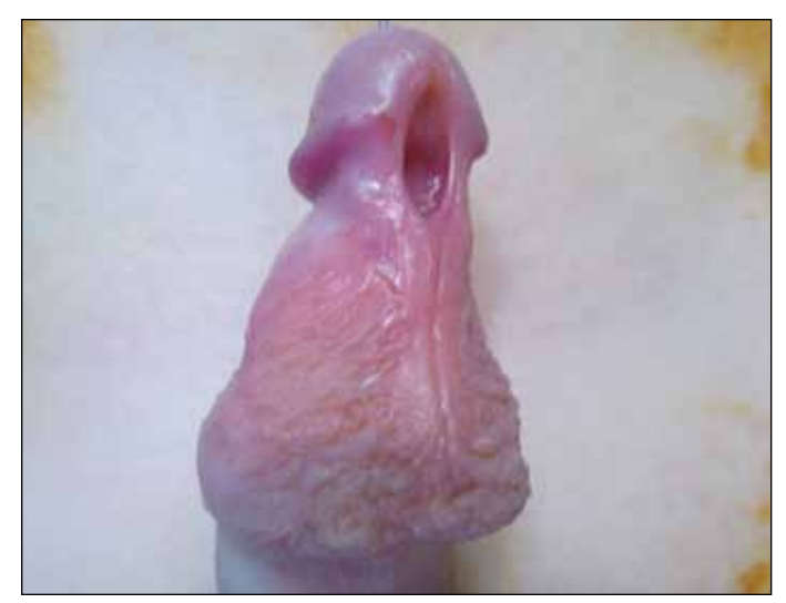
Fig 9. Megameatus intact prepuce hypospadias variant.

Neonatal circumcision is a safe surgical procedure that is generally well-tolerated. Circumcision complications can