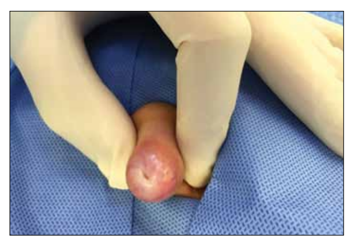
Fig 3. Lichen sclerosus of the foreskin.

Zavras et al conducted a prospective study using a mildly potent steroid, fluticasone propionate (0.05%), to achieve a 91% success rate in 1185 boys referred with a diagnosis of phimosis.<sup>18</sup> Long-term success is maintained in over 75% of the boys following initial success with steroid therapy.<sup>19,20</sup> Ku et al noted that success rates were higher in boys <3 years of age (92%) compared to those ≥3 years (70%), which may